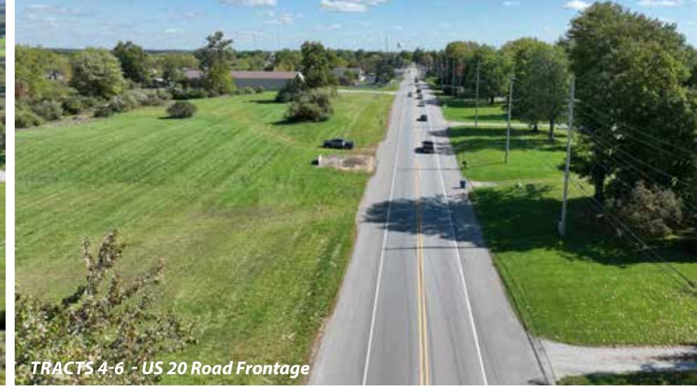
TRACTS 4-6 - US 20 Road Frontage