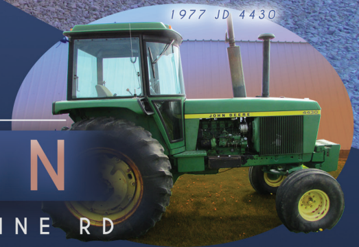
1977 JD 4430

3045 RICHMOND PALESTINE RD NEW MADISON, OH 45346