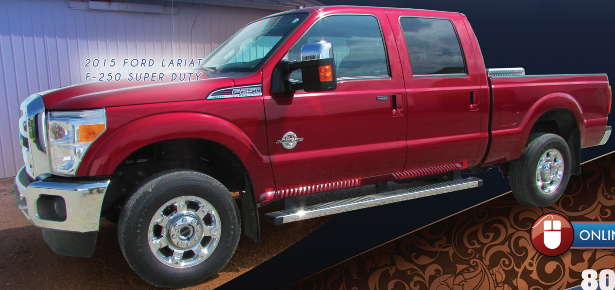
2015 FORD LARIAT F-250 SUPER DUTY

ONLINE BIDDING AVAILABLE on select items