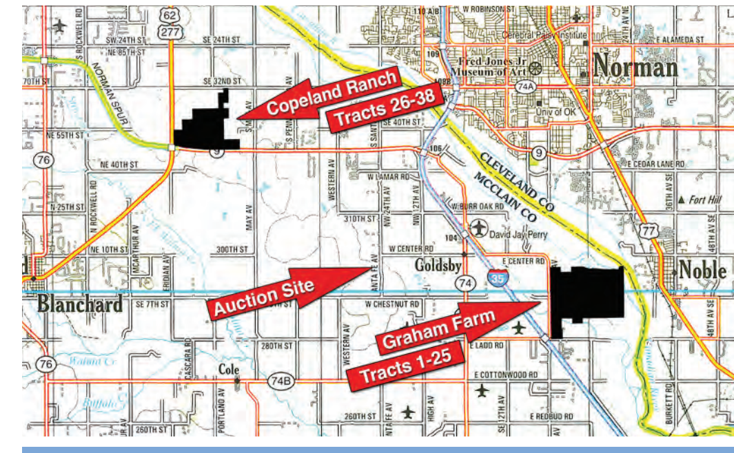
INSPECTION DATES: May 17 and June 5 from 1 – 4PM; June 19 from 2 – 4PM. Meet a Schrader Representative on Tract 30 for land tours.

TRACT 38: 26± acres that offers a tremendous view toward the Oklahoma City skyline, terrific potential building site.